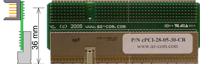
P/N cPCI-28-05-30-CR Rear I/O Right Angle Male top