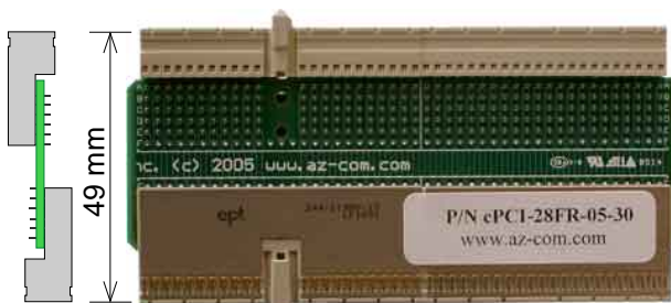
P/N cPCI-28FR-05-30 Rear I/O Female top