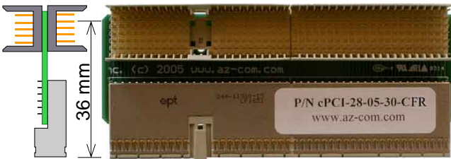
P/N cPCI-28-05-30-CFR Front and Rear I/O Right Angle Male top