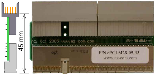
P/N cPCI-M28-05-33 Male top