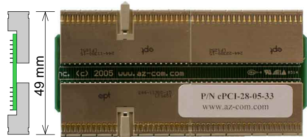
P/N cPCI-28-05-33 Female top