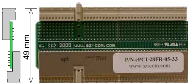
P/N cPCI-28FR-05-33 Rear I/O Female top