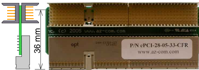
P/N cPCI-28-05-33-CFR Front and Rear I/O Right Angle Male top