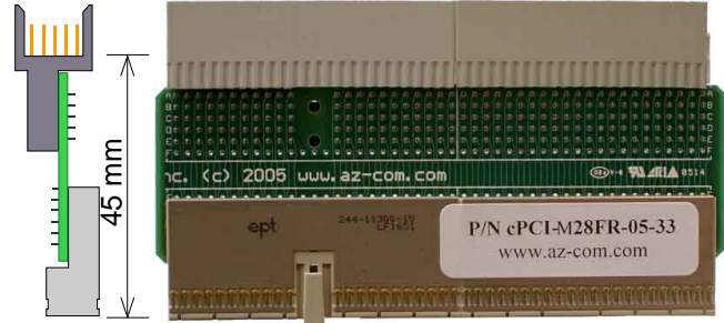
P/N cPCI-M28FR-05-33 Rear I/O Male top