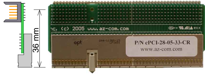
P/N cPCI-28-05-33-CR Rear I/O Right Angle Male top