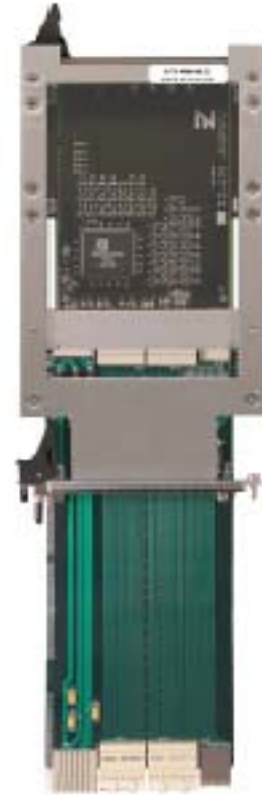
3U cPCIe Extender with optional frame extender and DUT